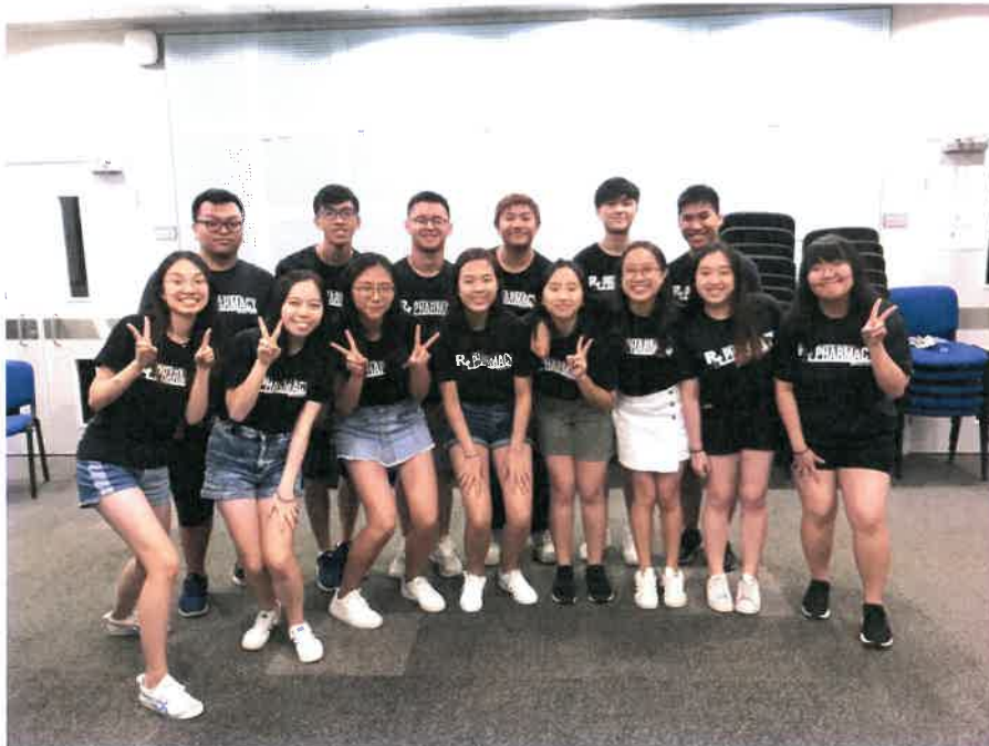
This was taken on our Orientation Day in August 2019 when I first joined the HKU pharmacy family. (first row 2 nd from the right)