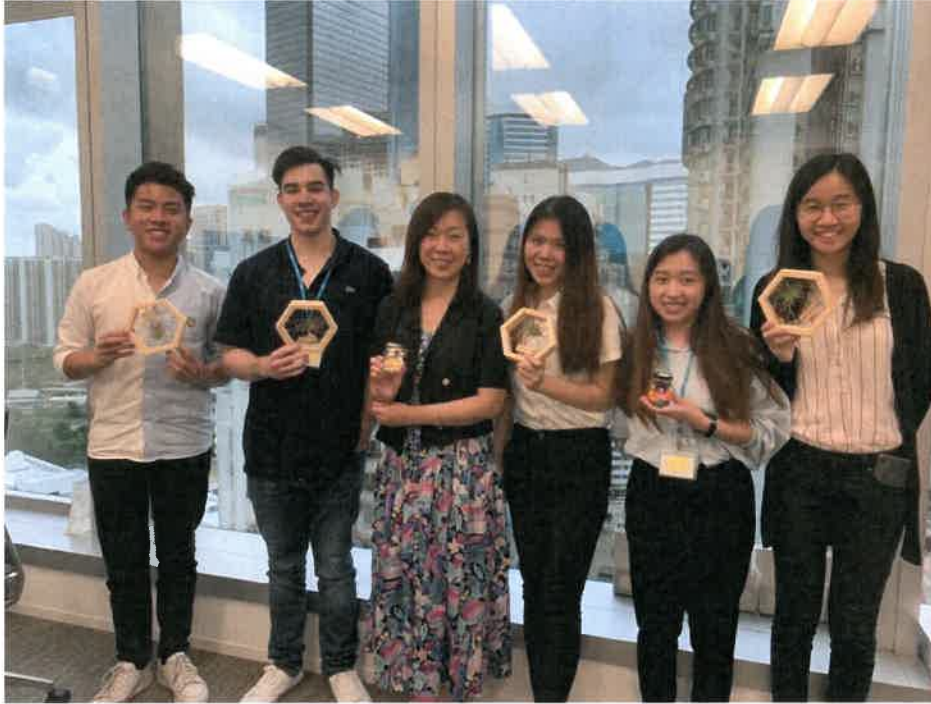
This was taken in August 2020 when I had my summer internship in Pfizer. This was the day when the company organised different activities as part of the 「168·家·健康」 campaign. (2 nd from the right)