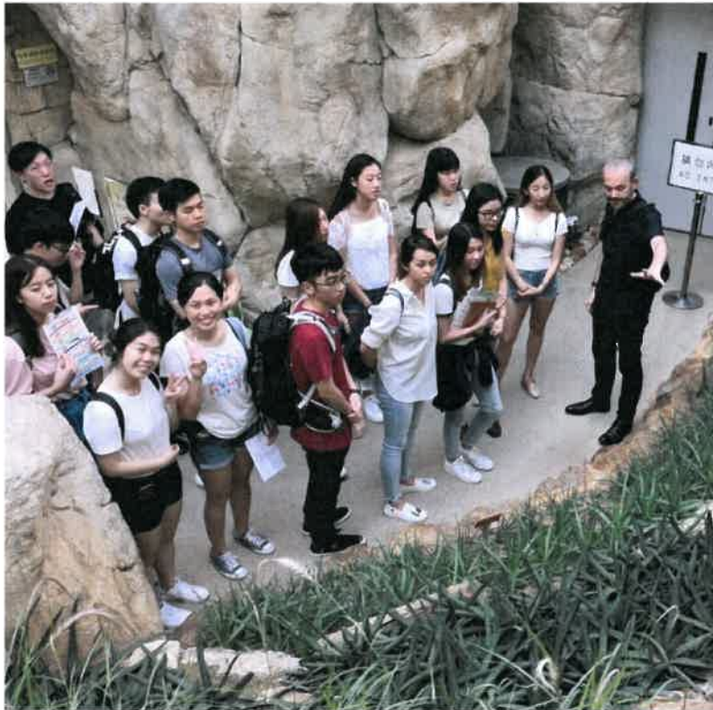
Photo 2: Hong Kong Zoological and Botanical Gardens (I am the one wearing a grey t-shirt)

Visiting Hong Kong Zoological and Botanical Gardens is a compulsory out-door activity of our toxicology course in the BPharm program. It can enhance our knowledge and interest in the toxicology of plants in Hong Kong.