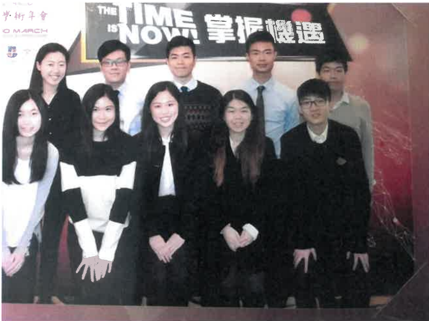
Photo 1: Pharmacy conference (I am the in the centre of the upper row)

I would also like to share with you two of my most memorable moments during the past academic year. Please see the photos attached in page two.